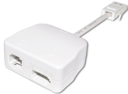
Z-350UK filter provides a DSL convenience jack for connecting a DSL modem